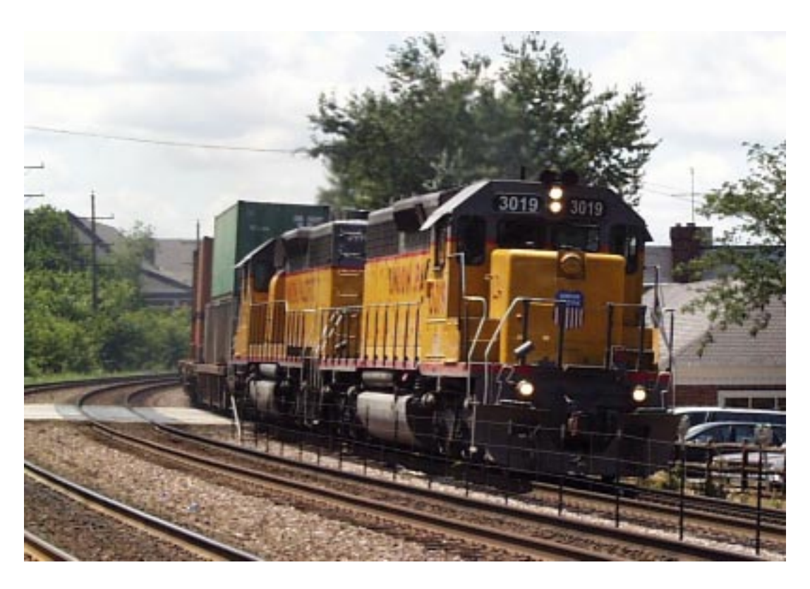
A UP train rounds the curve at the Glen Ellyn, IL depot on the former C&NW line west of Chicago in the outer suburbs. 1999 photo by Edward Cooke.