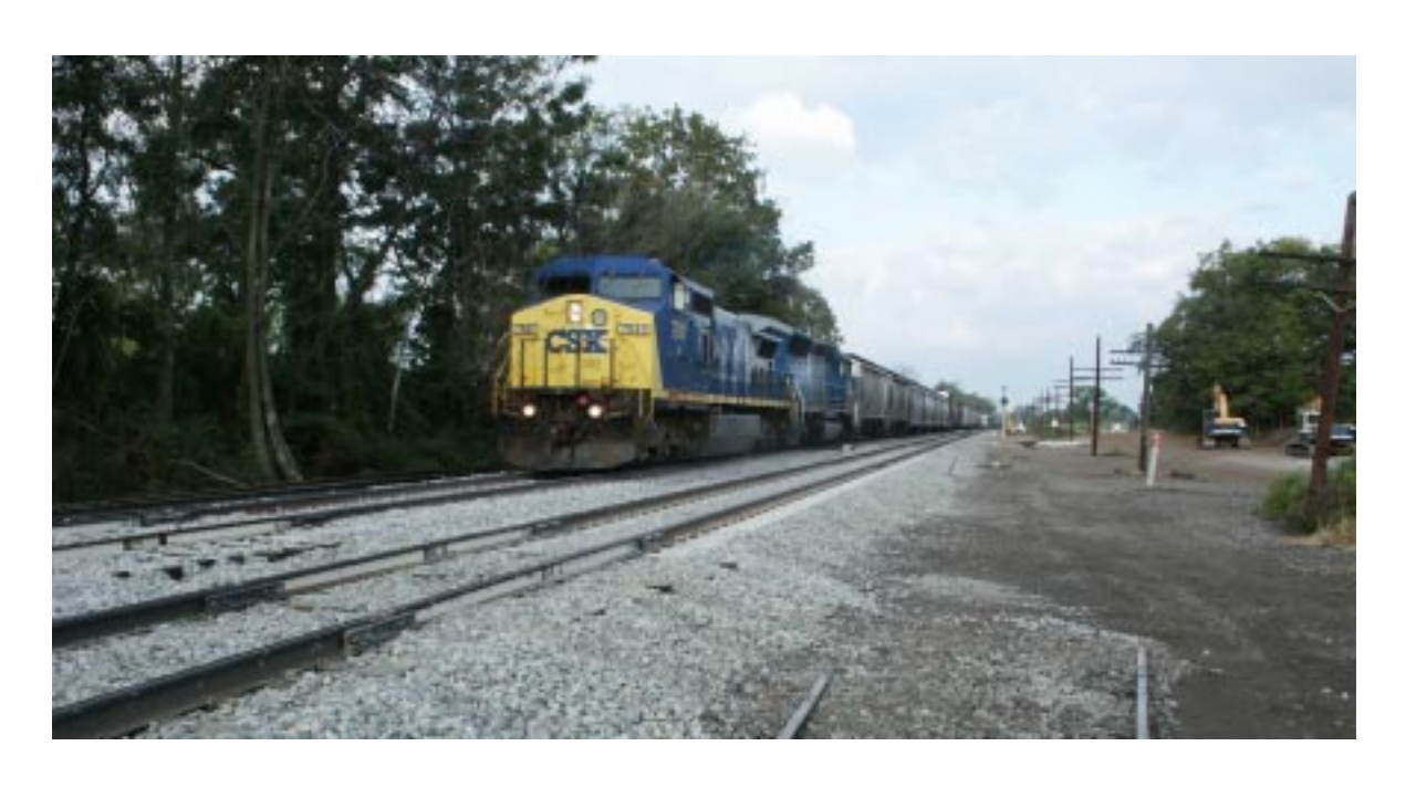
Eastbound CSX train at the new control point, CP Shen, located about 1/4 mile west of the Norfolk Southern overhead bridge in Shenandoah Junction, WV. Bringing up the rear of this train was a Missouri Pacific caboose being deadheaded east. The new control point should go into service in early March 2003. Photo R. Schroeder, 9-11-02