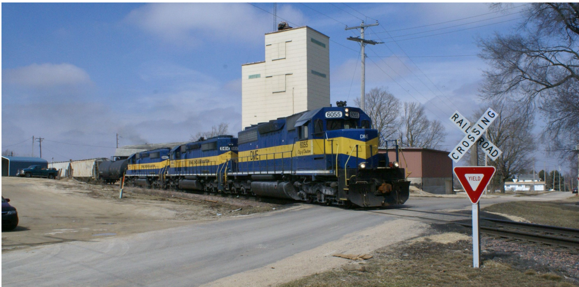
DM&E SD49 #6055 leads ICE 6414 and 6443 south on Train #471 at Monona, IA on April 7, 2013. The crew on this train had brought the NB #470, met the other crew and swapped trains and are now headed back to Dubuque, IA.