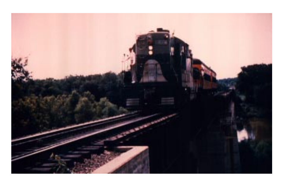
Wabash 474 leads the IT cars across the Wabash River Bridge, Attica.