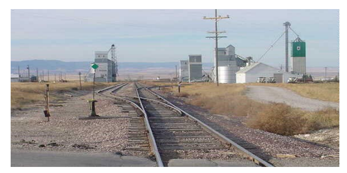
Looking west at Moore, Montana

The week before Thanksgiving myself and my track inspector from the Detroit area headed to Lewistown. With air travel changed after September 11, we found that more than an hour was required to go through security. I left early from Chicago; Carl from Detroit and we both arrived in Billings, MT around noon on Monday. It is a 2-plus hour drive to Lewistown and we spent the afternoon getting familiar with the rail lines in the area. (See map attached)